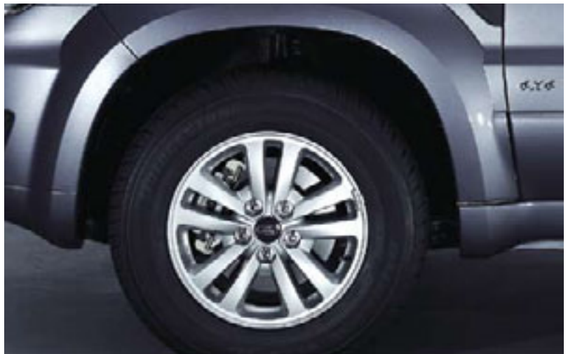
Prominent wheel arch and 16" tyre with 5-spoke alloy rim