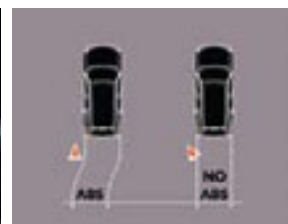
Anti-lock Braking System (ABS)