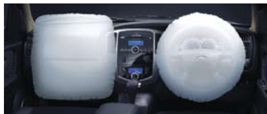
Driver, passenger and side* airbags