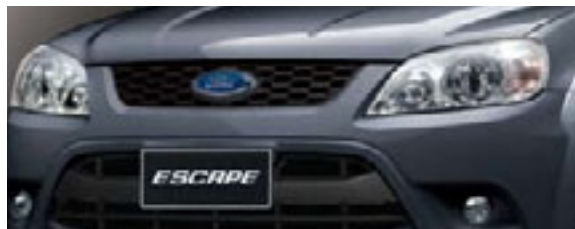
New honeycomb grille