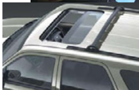
Electric powered sunroof*