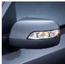
Side mirror & indicator light