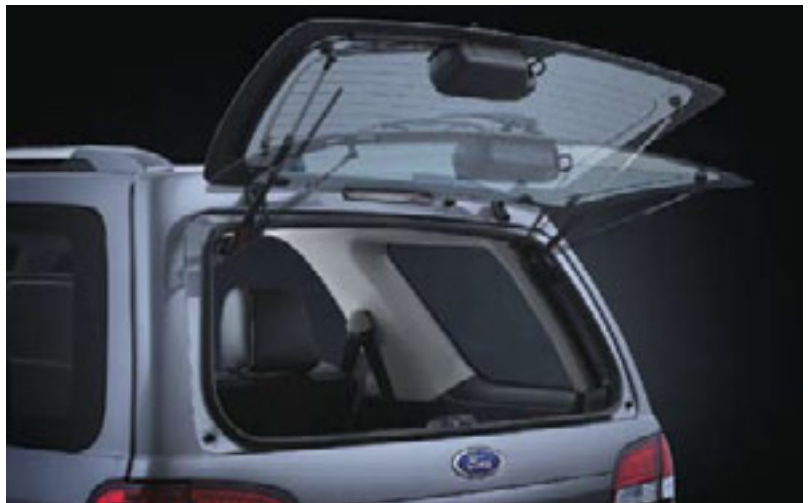
Rear door glass opens for access to cargo