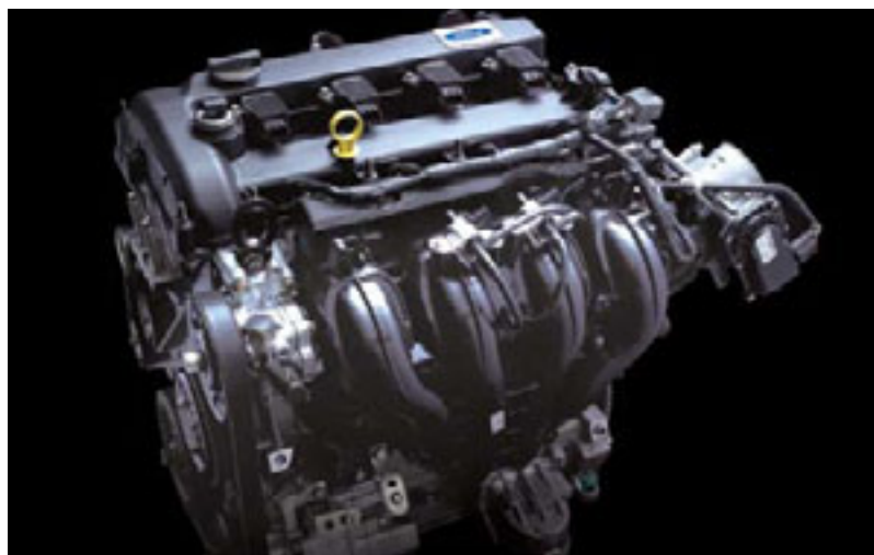
Responsive and fuel efficient 2.3 liter VVT engine with Electronic Throttle Control (ETC)