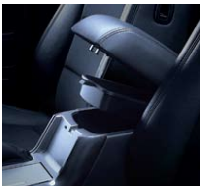
2-tier arm rest console