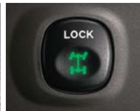
Control Trac II lock button*