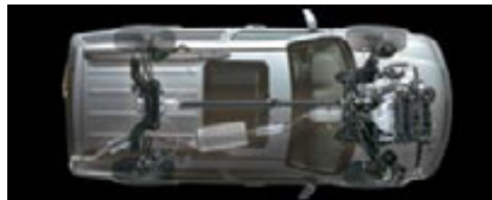
Ford Escape 4x4 drivetrain*