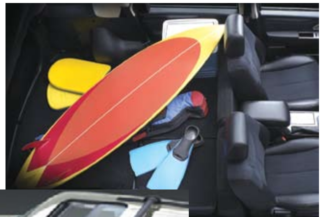
Rear seats that fold flat for more luggage space

A comfortable armchair-like seating, one touch climate control and a 6-CD MP3 player* makes extended drives a pleasure. With seats that fold flat and roof-rails*, you'll be able to handle just about any cargo for that long weekend, while the standard dual SRS airbags for the driver and front passenger include side* protection that provides you extra peace of mind.